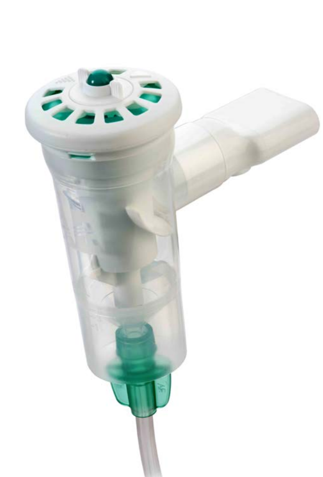
AEROECLIPSE ® II Breath Actuated Nebulizer