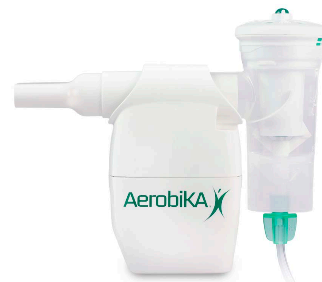
Combination Aerobika ® OPEP Device + AEROECLIPSE ® II BAN