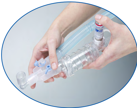
Use in Ventilator Circuit

Offset Wye Connector Allows for use in both standard and parallel wye circuits